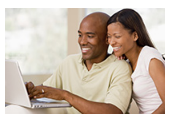
Tired Of Living Paycheck To Paycheck?

Applications with full details and requirements will be available on our <u>website</u> and at each branch beginning February 1, 2025